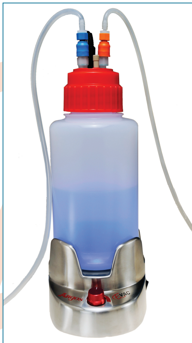
Illuminated LED light allows for easy viewing of fluid level

E-Vac is available with a 4-L polypropylene bottle or a 3-L glass bottle. Polypropylene and glass bottles offer lids equipped with quick-release tubing connectors for safe and convenient tubing connections; and level detection sensor that automatically shuts the pump off when the bottle is full. Polypropylene bottle also available with lid fitted with standard barbed tube fittings.