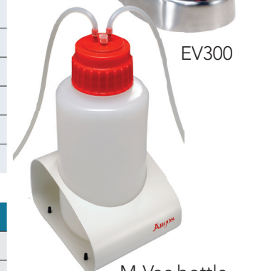
M-Vac bottle and stand sold separately